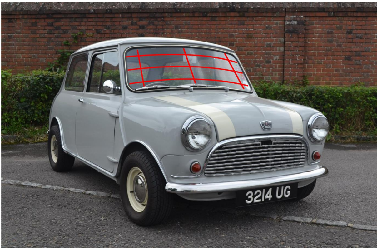
Picture 6 - 1957 Mk1 Austin Seven Mini