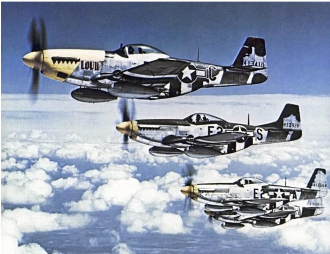
Picture 4 - North American P51 Mustang