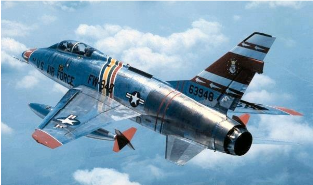
Picture 1-North American F100-F Super Sabre