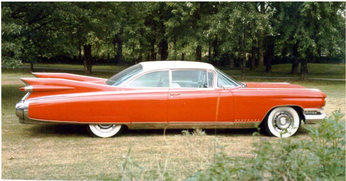
Picture 2-1959 Cadillac Eldorado