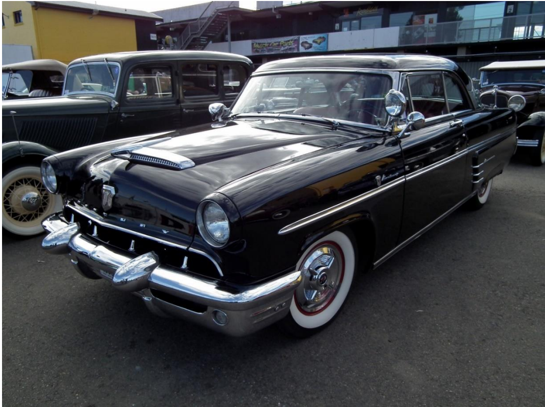
Picture 3 - 1953 Mercury Monterey